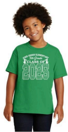
John Green 5th Grade Grad Signs and T-Shirt 2025-Graduation - Printed Names

For 5th grade parents only. The 5th grade grad store is now open! Link here .